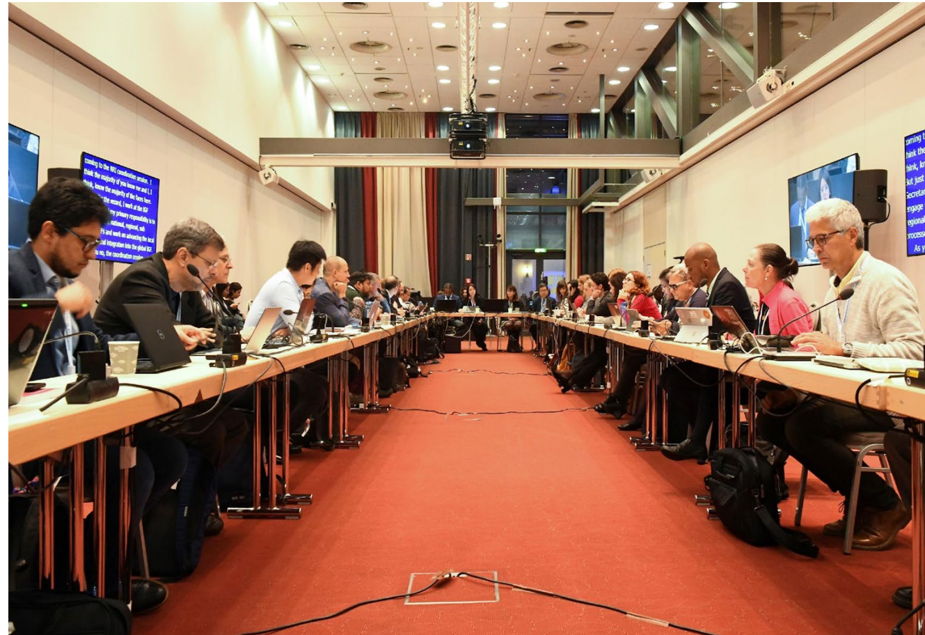
IGF 2019 NRIs Coordination Session, Berlin