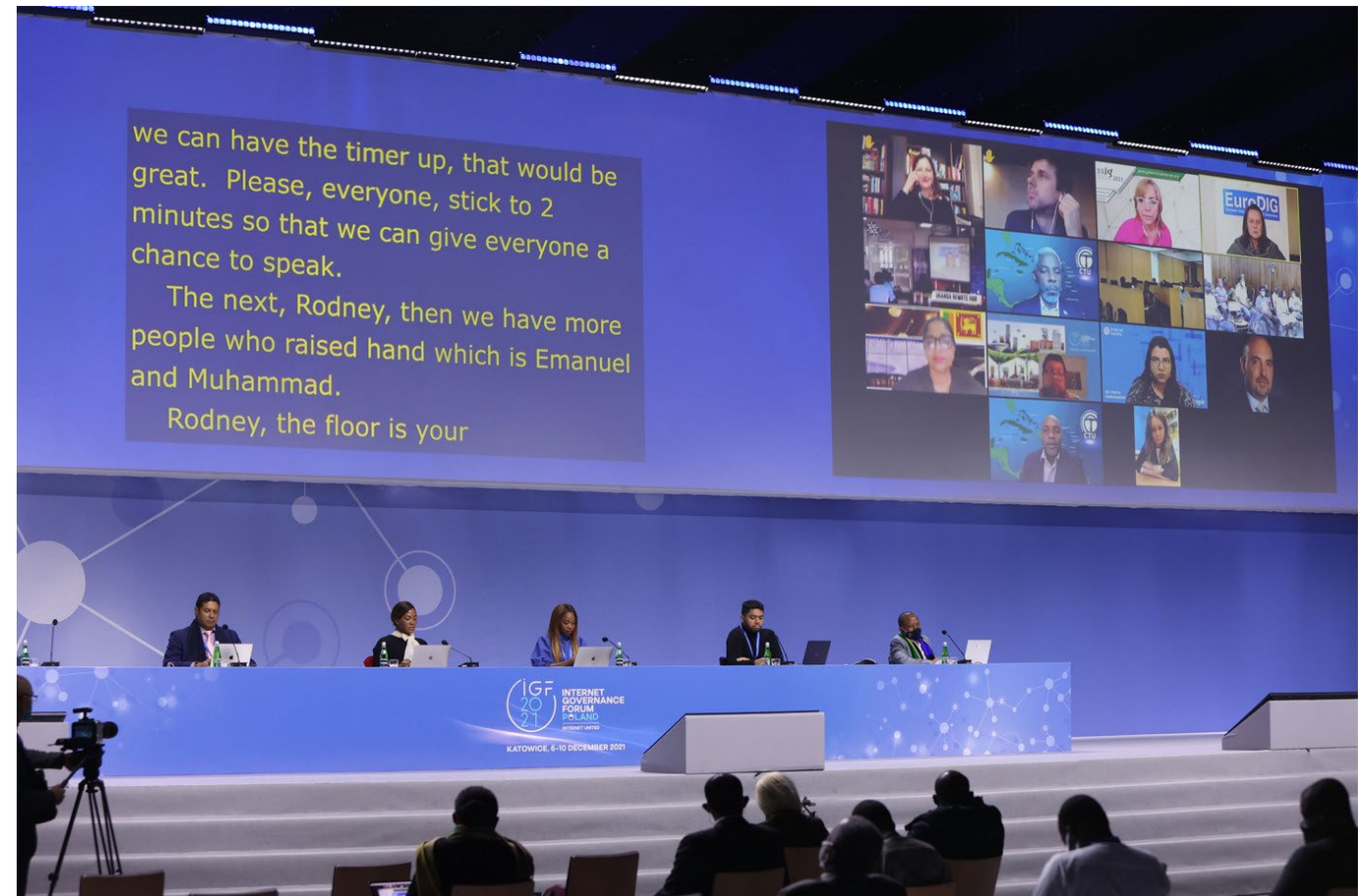
IGF 2021 NRIs Coordination Session, Katowice

• There were also views to consider addressing cybersecurity international cooperation through the NRIs main session.